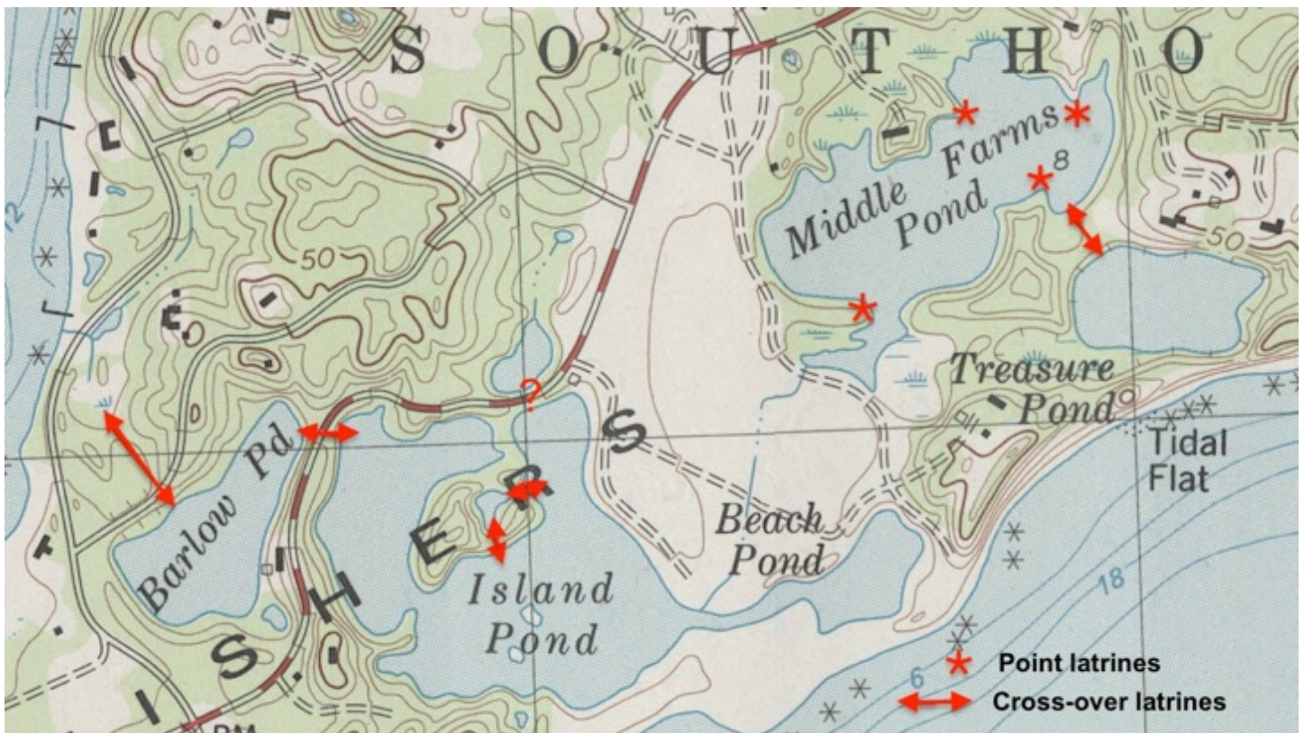
Photo 20. A topographic map showing a portion of Fishers Island with potential otter latrine sites noted and verified. The Middle Farms Pond sites were surveyed by kayak in March, during the breeding season when scenting behavior at latrines is high and the lack of leaves on trees and shrubs enables surveyors to easily discern otter latrine sites.

Also note that there were no otter latrines identified between Island Pond or Treasure Pond and the bay (Block Island Sound) despite the potential for a “cross-over latrine” in this area. Although otters will forage for fish and crab prey in the nearshore, shallow bay, the dynamic nature of this shoreline, with its periodic wash-overs from storms, seems to limit its usefulness as a latrine whose purpose is to communicate key information to other otters utilizing the area.