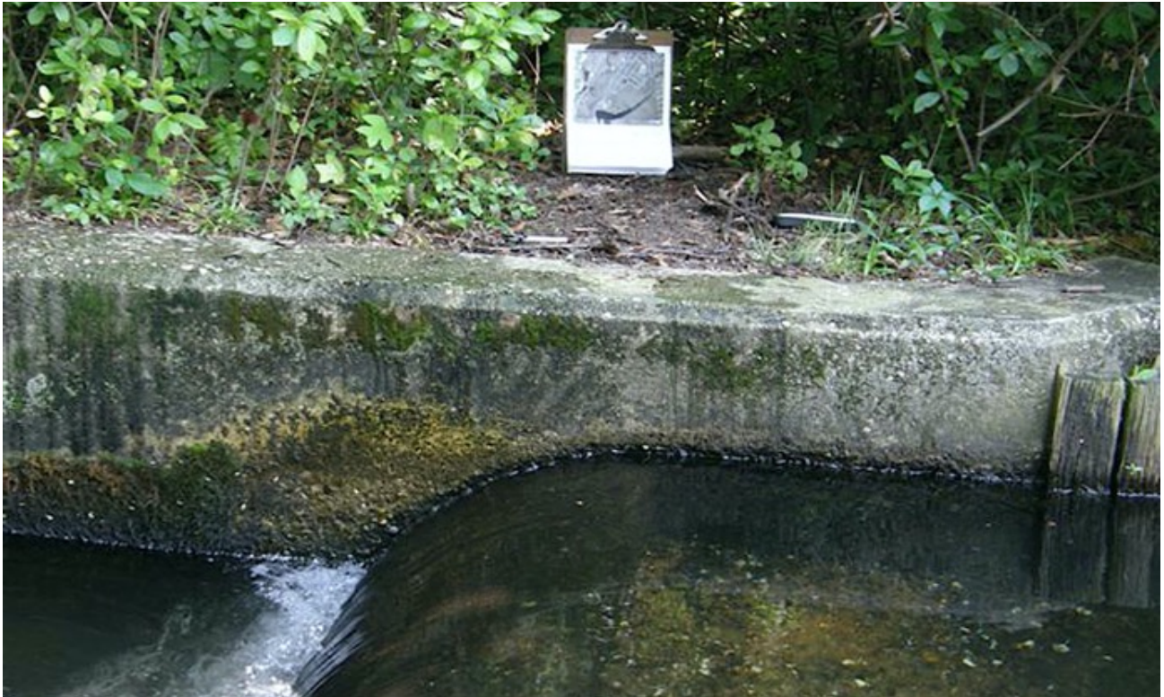
Photo 15. Otter latrines can be as small as one square foot, as found alongside this dam on the Nissequogue.

1) where otters must exit the water to get around a dam or other obstacle;