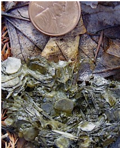
Photo 5. When feeding on fish, fresh scat is slimy and has a greenish or black color.