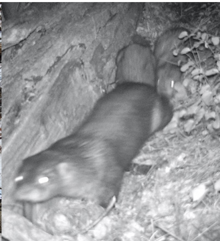
Photo 52. A female with two 5-month-old pups approaches Waterside Road in July.

Other otter roadkill sites, including the Rte. 51, Southampton site and the Rte. 58 site in Riverhead, will most likely require the construction of culverts under the road. Even though full-grown otters will use culverts as small as twelve inches in diameter, this would be an expensive mitigation measure.