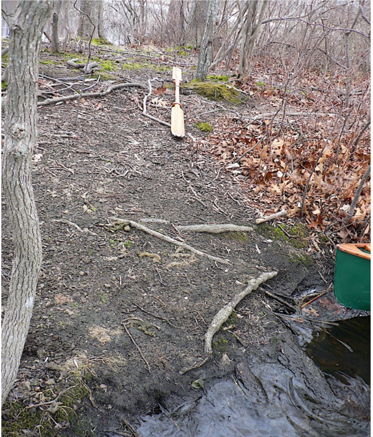
Photo 19. This conspicuous and short otter “cross-over latrine” between two freshwater ponds in Southold (the further pond is visible in the background) is regularly visited by many different species of wildlife and contains “sign” of Canada goose (scats and in one year a nest), great blue heron, raccoon, and deer in addition to otter scats.

5) where otters exit the water to travel overland to reach another pond or creek. These routes usually follow the shortest possible route from one pond or creek to the other.