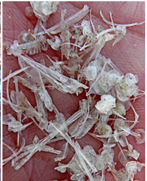
Photo 7. Otter scats are slow to decompose and visible for weeks, a helpful feature for surveying.