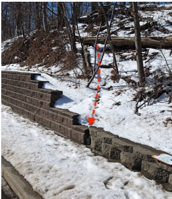
Photo 51. Snow cover and fresh tracks enabled this road crossing to be pinpointed.

documentation of otters using this area over the past nine years, and the crossing location on Waterside Road known, the last question is: “what is the appropriate mitigation measure for this site?” We decided to push for speed bumps to slow traffic down as the most feasible and easy to implement option here.