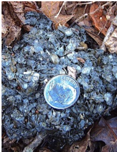
Photo 6. Over time it dries out, first turning a charcoal gray and eventually white.