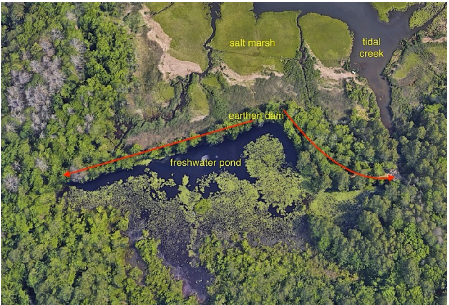
Photo 18. In the case of earthen dams with good vegetative cover, in addition to a latrine at the pond’s outlet, there may be several other latrines spaced along the length of the dam, as is the case here at Staudingers Pond, East Hampton.

4) at pond inlets, outlets and the confluence of tributary streams;