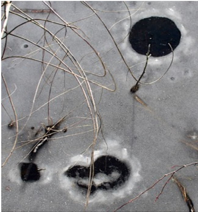
Photos 47. Note the raised rim around the edge of these otter “pushups.”

https://aslopubs.onlinelibrary.wiley.com/doi/pdf/10.4319/lo.1965.10.suppl2.r290