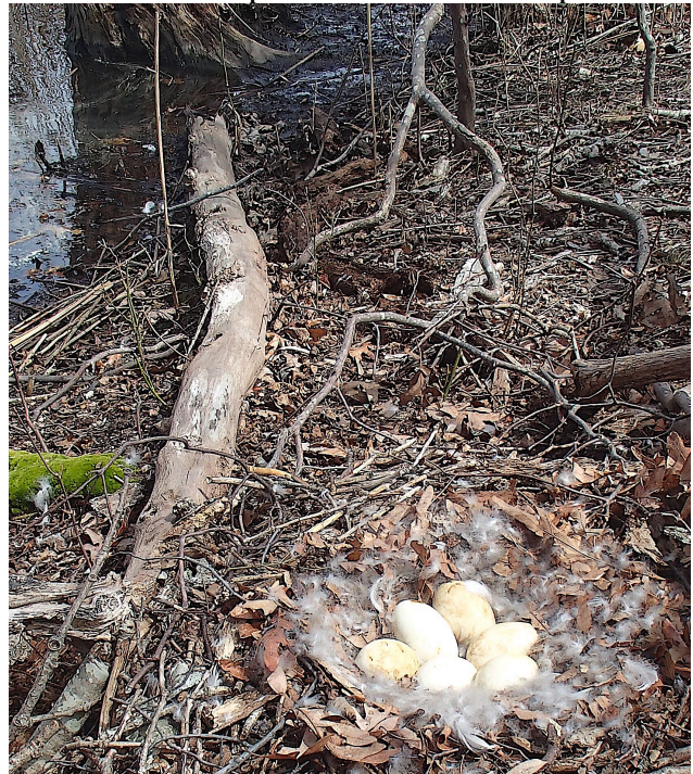
Photo 40. Canada goose nest at an otter latrine.

Still, game trails leading from the water to the top of a level embankment (photo 39) are worth examining. I have found waterfowl nests on otter latrine sites, as was the case at a Southold "cross-over latrine" used by otters as a shortcut between two ponds (photo 40). I had placed a remote camera there in the fall and retrieved it in spring. Among the hundreds of Canada goose photos was a sequence where an otter came by and was confronted by a very agitated male goose. After a brief stand-off, the otter calmly turned around and retreated its steps back to the other pond.