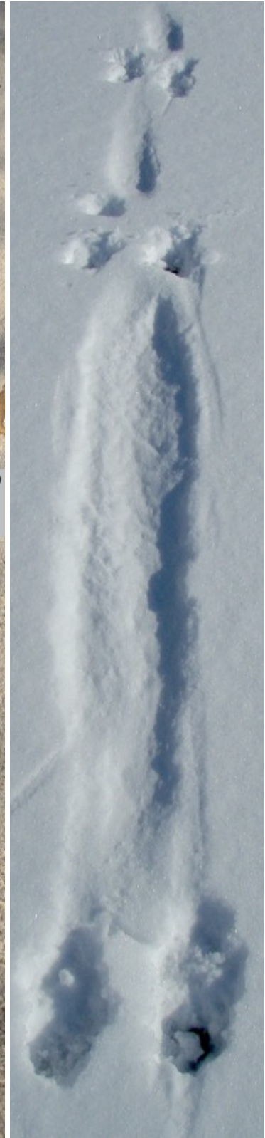
Photo 32. Raccoon walking gait. Photo 33. Otter's lope gait. Photo 34. Otter slide on pond.