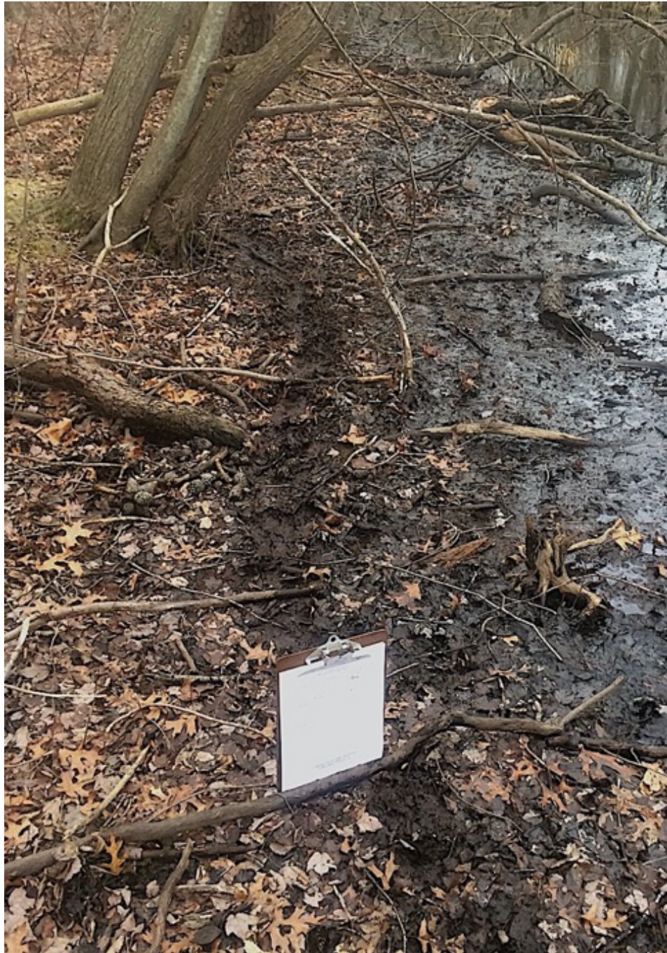
Photo 21. A typical raccoon trail following the edge of a swamp in the headwaters of the Connetquot River.

Both otter and raccoon have five toes on front and hind feet, and their respective foot dimensions overlap in length and width. Otter feet are webbed, but the webbing doesn't always register in tracks.