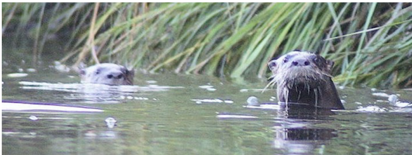
Photo 1. The otter on the right is “periscoping”, a behavior in which the head and part of the neck is visible; a useful feature to distinguish otters from beaver and muskrat when swimming. on the Nissequogue River.