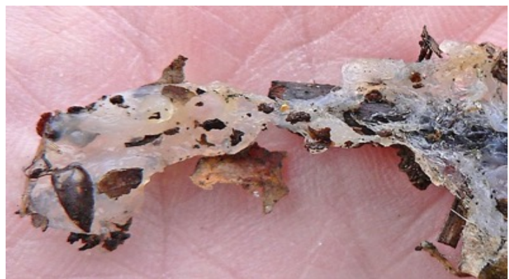
Photo 11. It dries quickly into a rubber-like form before disappearing completely.