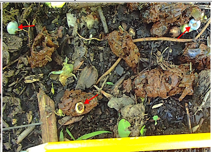
Photo 9. The arrows point to hard, round objects resembling seeds; this fresh scat could be confused with raccoon scat. These are crayfish gastroliths; they store calcium before molting, enabling a speedier shell hardening process.