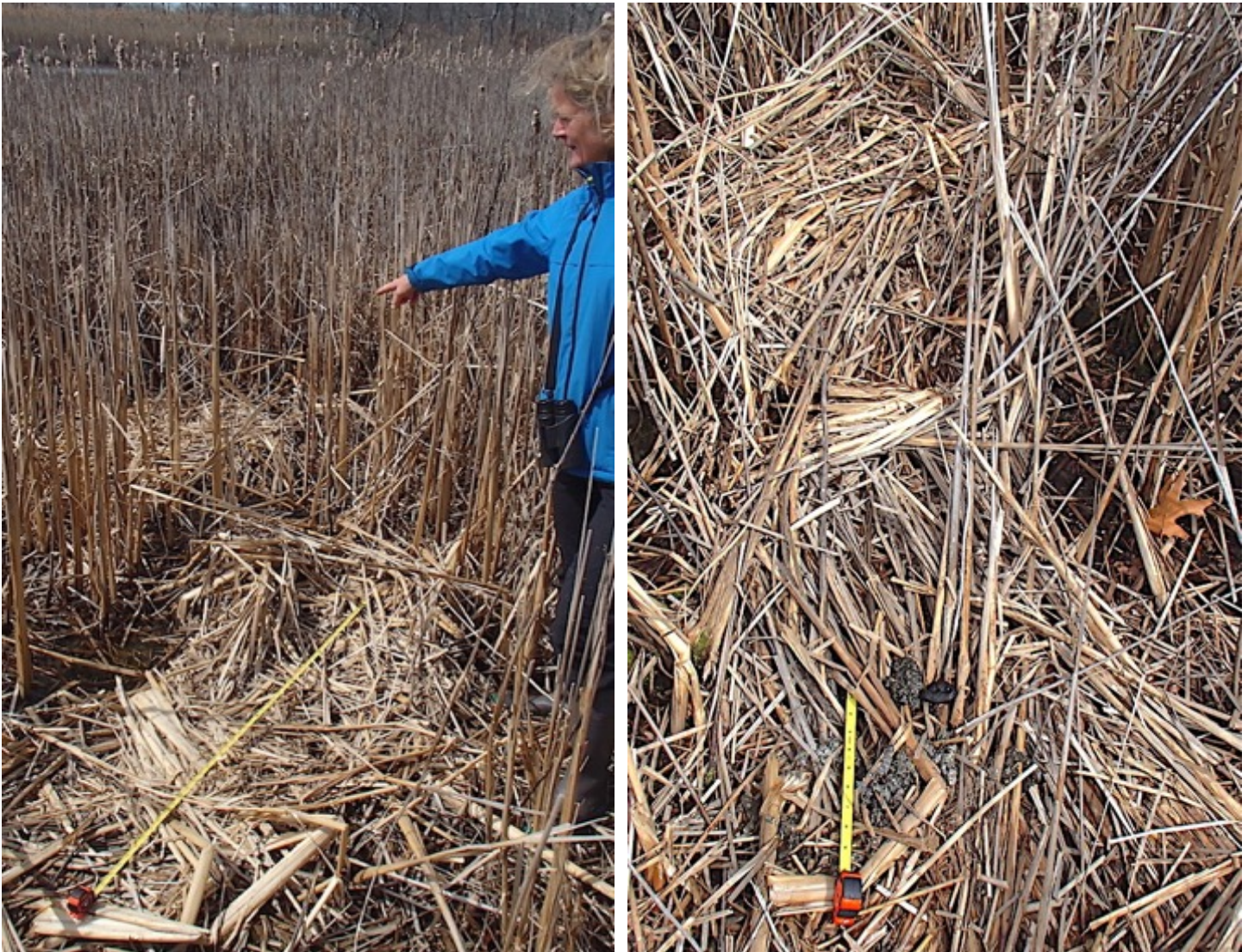
Photos 41 & 42. Otters created beds or “couches” for resting in the middle of this dense stand of cattails in Southold.

There was an abundance of otter scat at these sites, as much as at any otter latrine on Long Island (some is visible near the tape measure in the photo on the right). I'm not sure this qualifies as an otter latrine or “scent station” as most of the scat material was in shallow water and may not retain scent for communication with other otters.