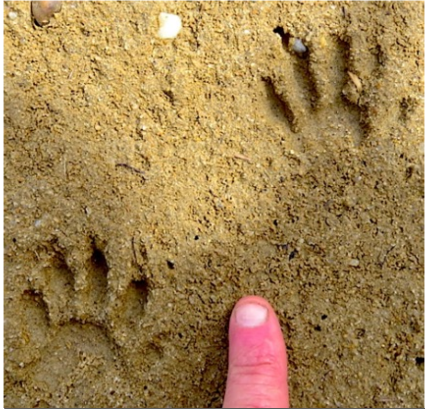
Photo 30. The raccoon's left hind foot below its right front.

Note that the otter's bulbous toe pads registers deeper than the rest of the toe, resulting in a very faint connection to the palm pad, while the raccoon's toes register a uniform depth and show a connection from the toe tips to the palm pads. The yellow arrow points to the otter hind foot's inner toe that is longer and lower on the foot as compared to the raccoon hind foot's inner toe (nearest the finger); this is an excellent feature to distinguish between tracks of the two species. The raccoon's front foot can be distinguished from the hind by the longer, more slender toes on the front feet.