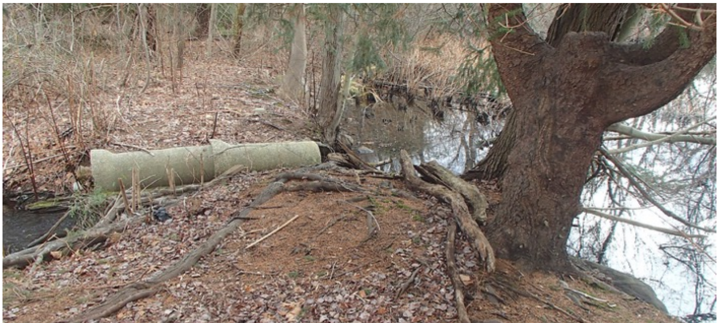
Photo 14. A potential otter latrine site under a large conifer at the outlet to small pond in the Nissequogue headwaters.

As a result of their behavior at latrine sites, such as rolling on the ground to dry off, scraping leaves and duff into a pile with their front feet, and stomping with their hind feet to deposit scent from glands located on the hind foot pads, latrines are often obviously disturbed sites cleared of ground vegetation and leaf litter and easy to discern even from a distance.