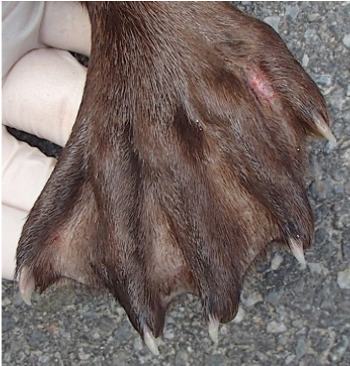
Photo 22. Topside of otter left hind foot.

It is helpful to examine the foot morphology of these two species as it relates to their tracks.