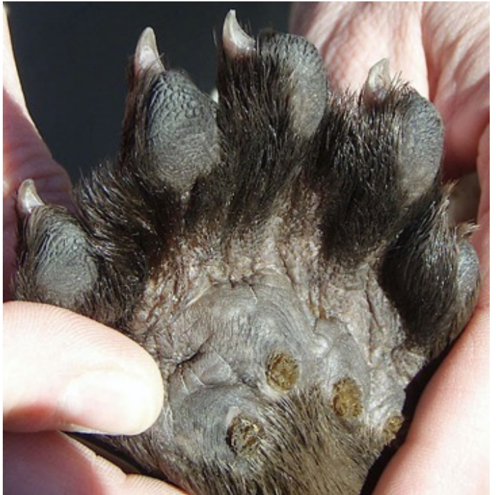
Photo 23. Sole of otter hind foot.

The dorsal view (photo 22) of the otter's hind foot reveals its extensive webbing (significantly more than on the front feet) and the ventral view (photo 23) shows its bulbous, oval-shaped toe pads and four circular, velcro-like tabs on the palm pads. The tabs are conduits for scent. At latrine sites, otters will repeatedly stomp their hind feet in a behavior called the "latrine dance" to release scent.