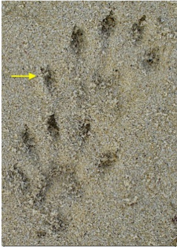
Photo 29. An otter's right front right foot below its hind.

Keeping in mind these differences in foot morphology, let's examine some tracks of raccoon and otter in sand and snow, and the common gaits of each species in both substrates.