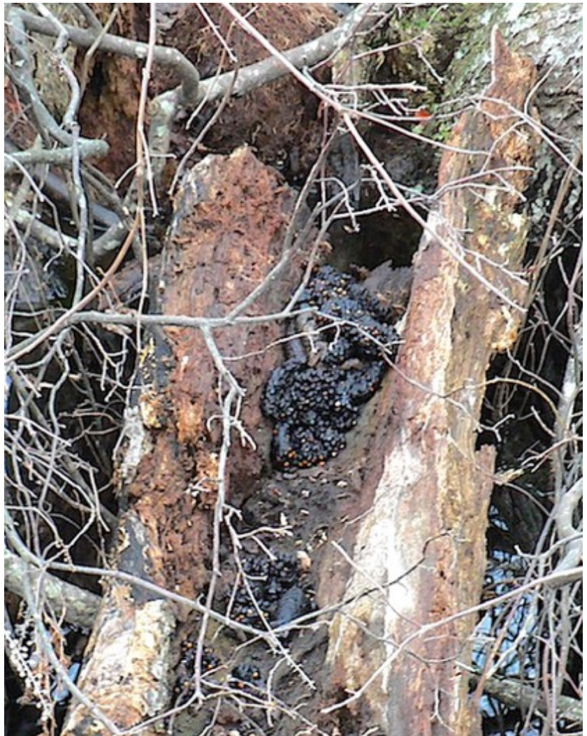
Photo 38. Raccoon latrine composed of fruit remains found on a log extending from shore into a pond.

CAUTION: Wildlife scat provides useful species identification clues and is often collected for wildlife diet studies. While I do not know of anyone that has gotten ill from closely examining wildlife scat, you should be aware that there are several dangerous parasites in wildlife scats that could be transmitted to humans. Of particular concern is inhaling dust particles containing eggs of the parasite from old, dried out raccoon scats.