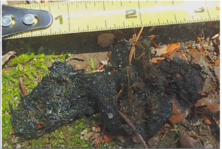
Photo 13. Scat with bones but no fish scales is the remains of frog or bullfrog tadpole: another otter favorite.

As a result of their behavior at latrine sites, such as rolling on the ground to dry off, scraping leaves and duff into a pile with their front feet, and stomping with their hind feet to deposit scent from glands located on the hind foot pads, latrines are often obviously disturbed sites cleared of ground vegetation and leaf litter and easy to discern even from a distance.