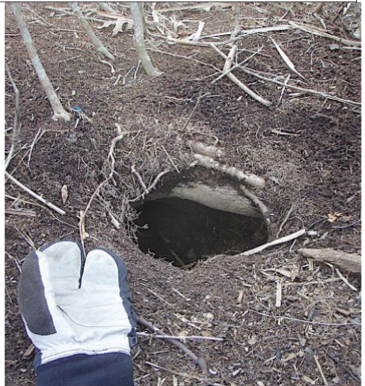
Photo 45. At one end of this large latrine was a den, possibly a natal den.