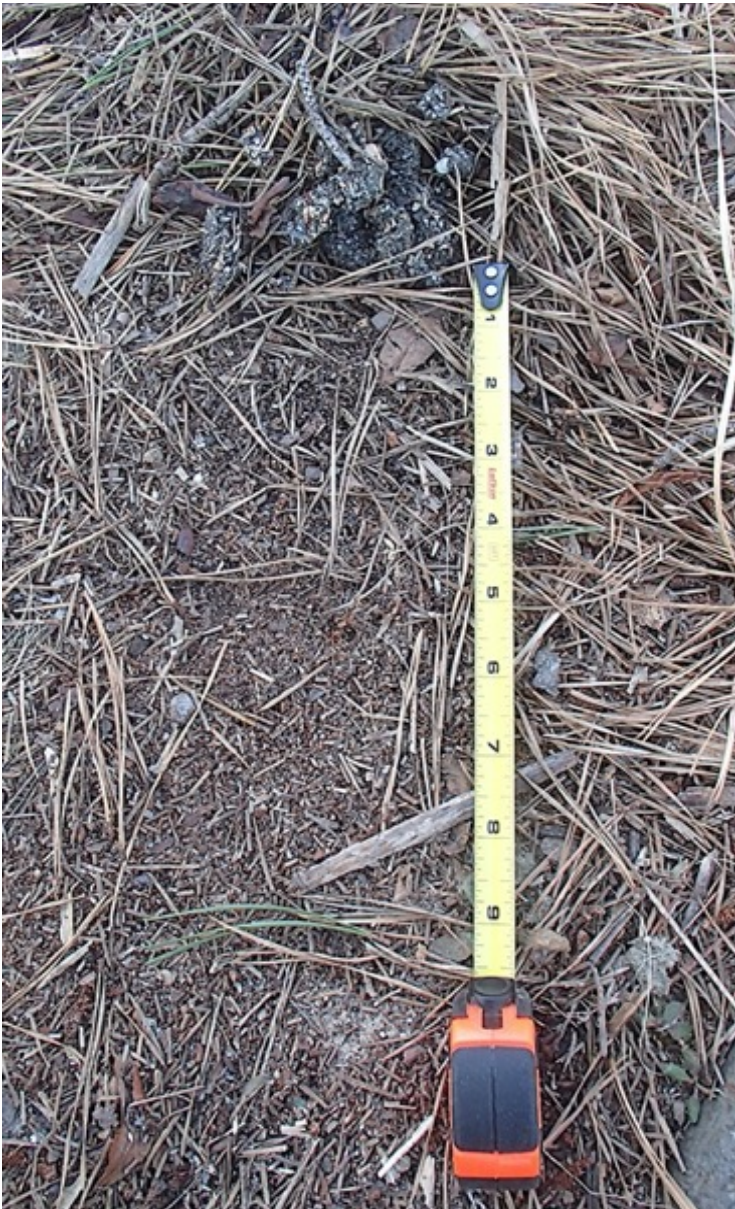
Photo 3. An otter latrine with a small scrape in the pine needles and the tubular-shaped scats of crustacean remains deposited on the pile of needles.

Occasionally a jelly-like, clear or yellow-white-colored, anal secretion is left. This dries quickly and disappears but is the best material for obtaining a DNA “fingerprint” of the individual otter.