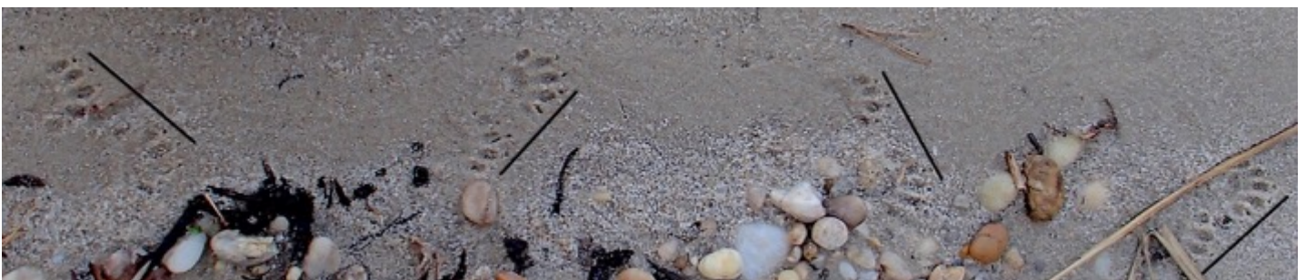
Photo 31. The raccoon's most commonly encountered track pattern, much different from the otter's typical patterns.

One doesn't always encounter perfectly detailed tracks like this, especially in snow, and the common gait, or trail pattern, of each is often more helpful to distinguish between the two species. Raccoons most often use a walking gait where pairs of feet land close to one another: the right hind foot lands next to the left front, and the next pair would be the right front and left hind, then back to the right hind and left front pairing, and so on. A straight line drawn along the leading edges of pair of prints creates a diagonal. The diagonals alternate in the direction it slopes from one pair to the other, as shown by the black lines below.