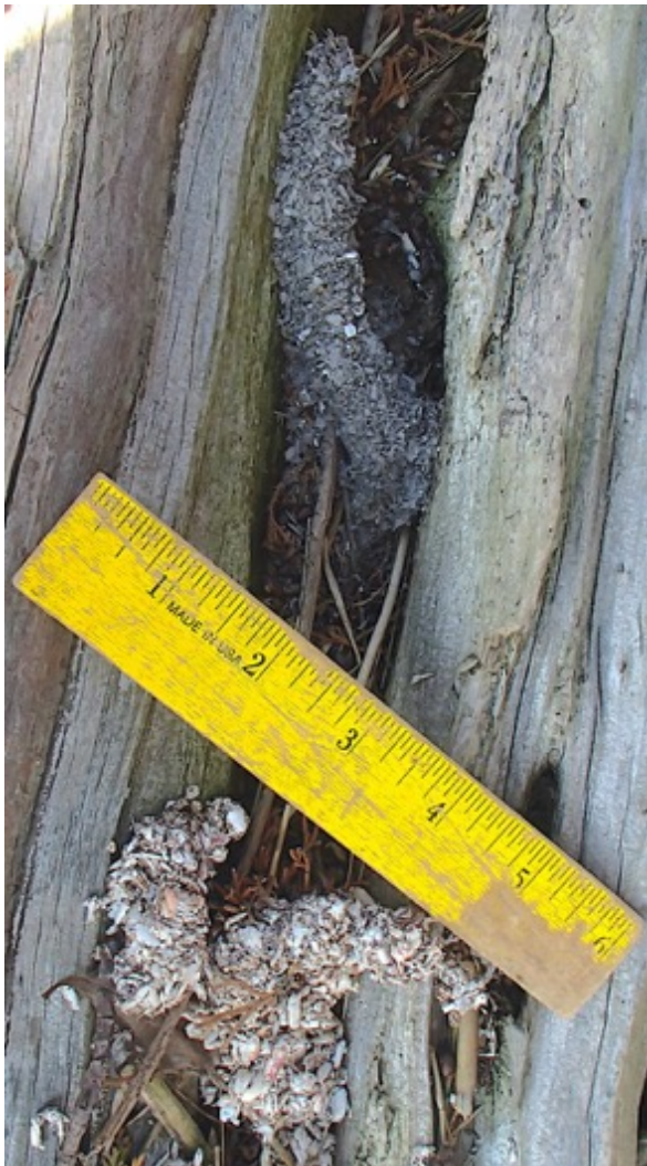
Photo 37. Raccoon latrine composed of fish (above the ruler) and crayfish remains (below) and elevated above the ground on a log adjacent to water.

As noted in the section “ DESCRIPTION OF AN OTTER LATRINE ” and photos 3-13 above, otter scats on Long Island are most often composed of the remains (scales, bones and shell fragments) of fish and crustacean prey. Raccoon latrines are often located in the vicinity of otter latrines, and as with the tracks of the two species, distinguishing the scats of both can be confusing when both are feeding on crustaceans (crabs and crayfish). Fortunately, crustaceans are most readily available during the late spring through early fall months and not during the best months (November through April) to survey for otter sign. During late fall through early spring otter scats are mostly fish remains and raccoons are feeding on mast (acorns, beechnuts and hickory nuts), carrion, berries and fruits. During that time raccoon scats usually reflect their omnivorous diet with undigested seeds and fruit husks usually visible. Raccoons will also scavenge carrion, including remnants of fish after filleting. The resulting scats are very otter-like in appearance but easily distinguished by the smell test. See “CAUTION” note below.