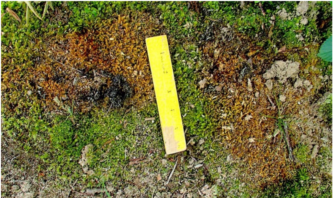
Photo 46. Brownout in a bed of moss caused by otter urine and scat at an otter latrine.

At potential otter latrine sites with moss or other low-growing, green vegetation, repeated deposits of nitrogen-rich urine and feces may eventually kill the vegetation, creating very conspicuous, brown-colored areas. As mentioned earlier, other wildlife species including raccoons and a variety of waterfowl often pass through and rest at potential otter latrine sites as well as established otter latrines, and brownouts can be created by excretions from these other animals. Although the presence of brownouts alone cannot be used to document otter latrines, these are worth keeping an eye out for and, when noted, making a close examination for otter scat when surveying.