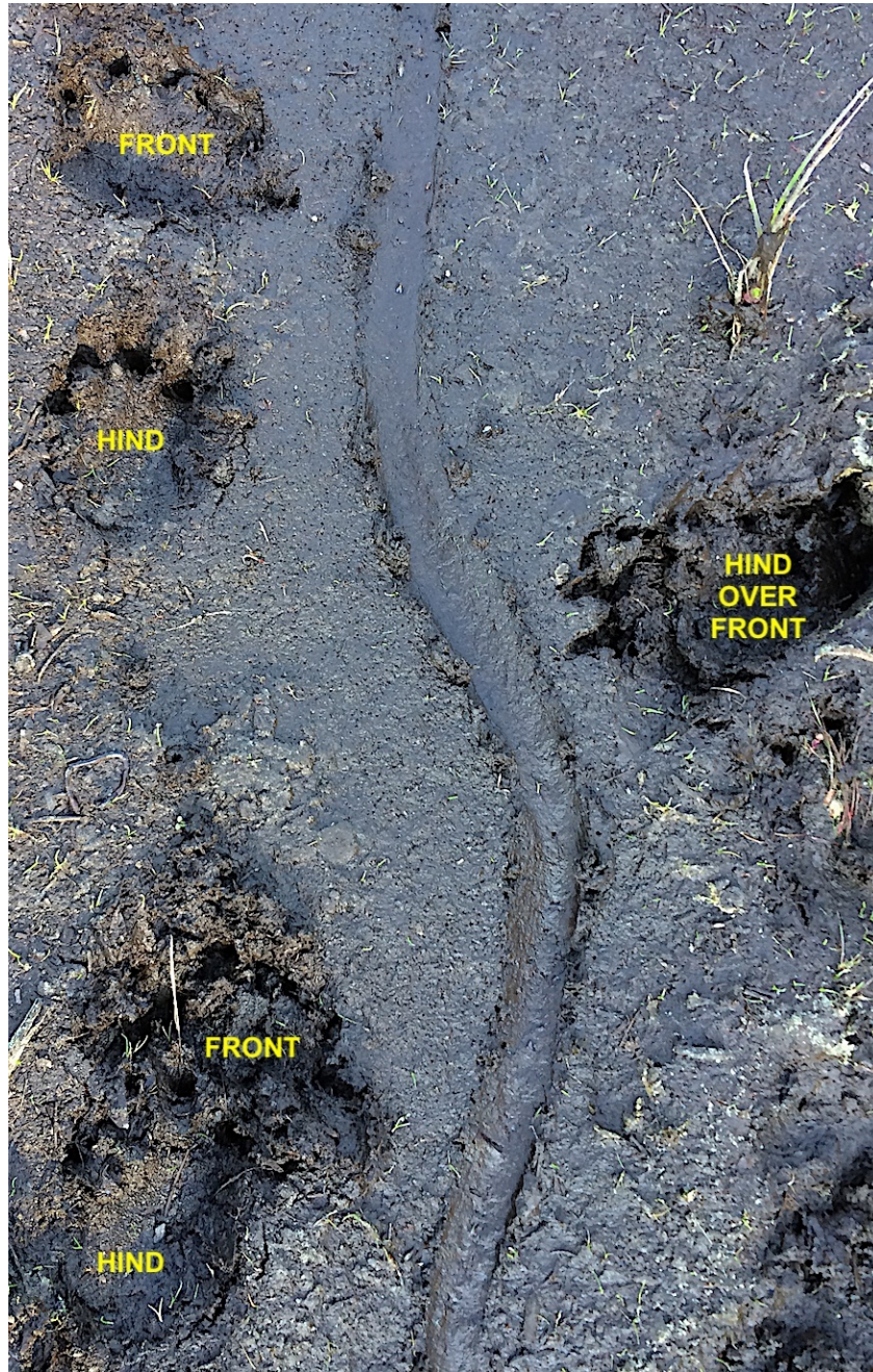
Photo 35. Snapping turtle tracks traveling from bottom to top of photo with a trail width of 8-10 inches.

While raccoon tracks are by far the most easily confused with otter on Long Island, I have received photos of tracks of two other species that colleagues have confused with otter and that are worth mentioning. Both other species are found in riparian habitat and show tail drags in soft substrates.