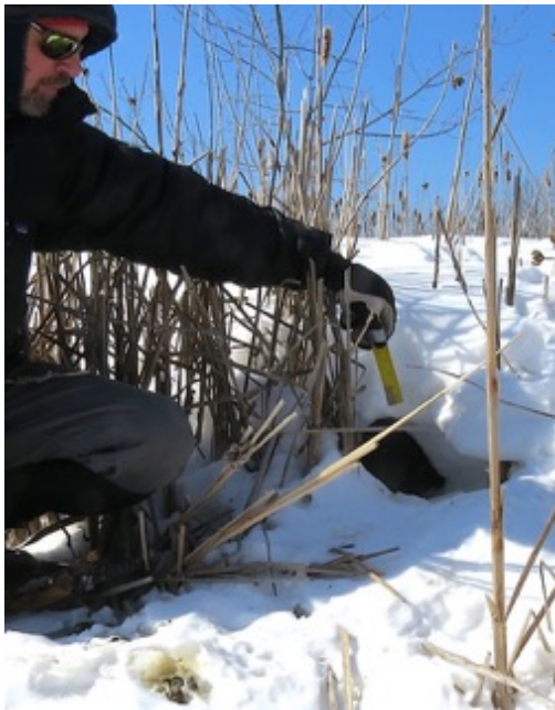
Photo 43. A "snow cave" created by otters in a cattail marsh (LEFT).

Several published studies found that otters use a wide variety of temporary den types and resting areas based on availability and convenience. A 16-month study in Idaho found that a single otter used at least 88 different den and resting sites (the latter would include couches) within its home range. Of the 1,283 resting sites identified among the otters with implanted tracking devices, 38% were beaver lodges and bank dens (Melquist and Hornocker 1983). Unlike couches or beds constructed in secluded areas of riparian vegetation, enclosed dens may provide an extra layer of protection from rain, snow and cold temperatures and therefore may assist otters in meeting their energy needs and reducing thermal stress during the winter months. It is not clear how important enclosed den sites as resting areas are on Long Island, with its relatively mild winters. But dens may be important for giving birth and raising young.