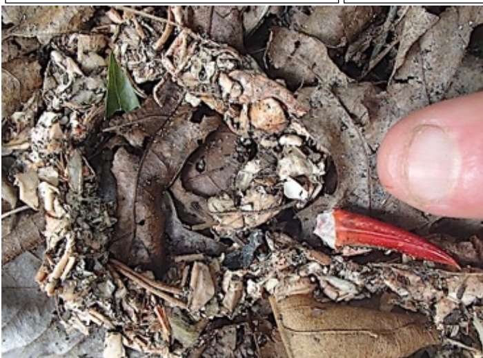
Photo 8. Other favorite otter prey includes crustaceans, such as blue crab and freshwater crayfish.