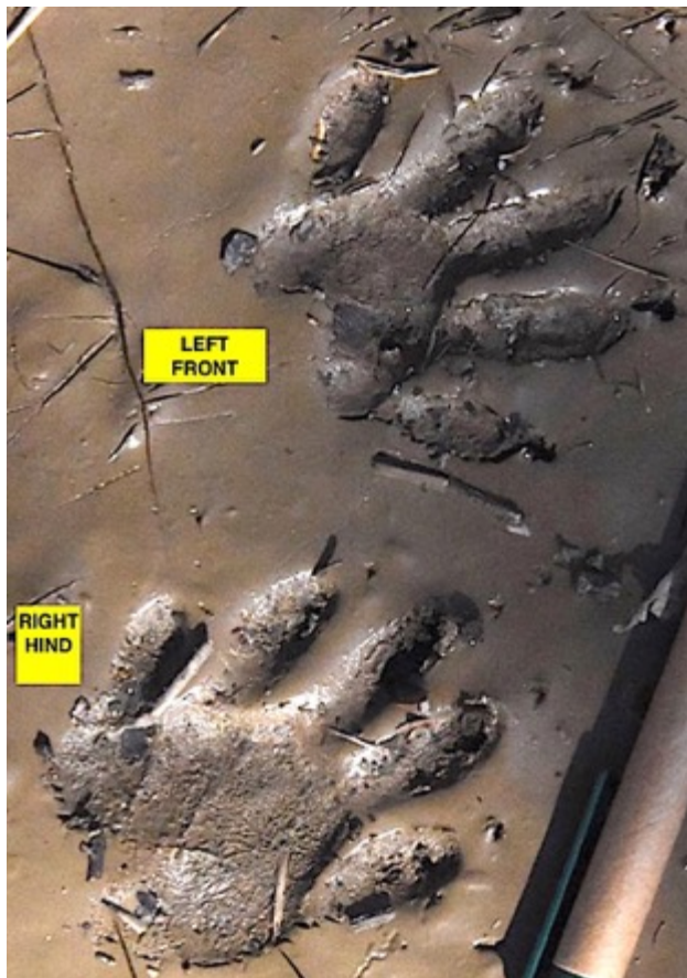
Photo 27. Typical prints of raccoon front and hind feet in mud illustrating the front foot's longer toes.