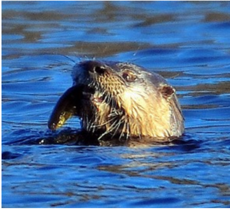
Photo 54. First known photo of a river otter on Long Island. December 2008.