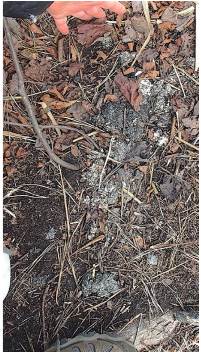
Photo 4. Otter scats are not always placed atop the pile of leaves and duff created by the scrape. Here the scats are a mix of fish and crustacean remains.