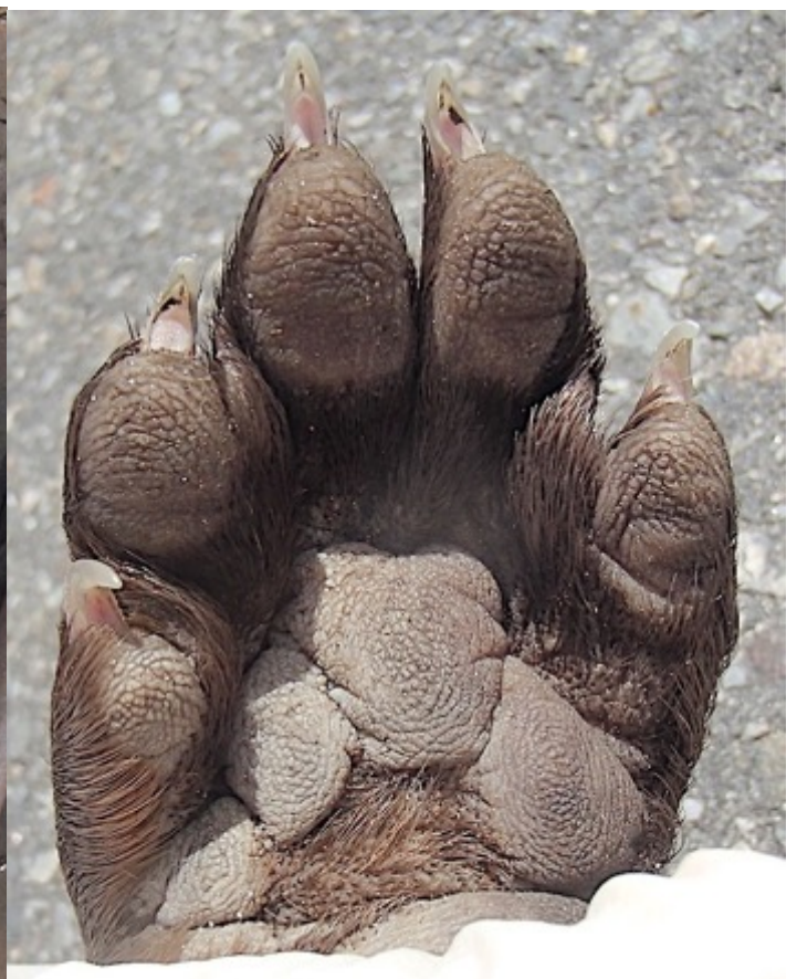
Photo 28. The front left foot of an otter showing its bulbous toe pads.