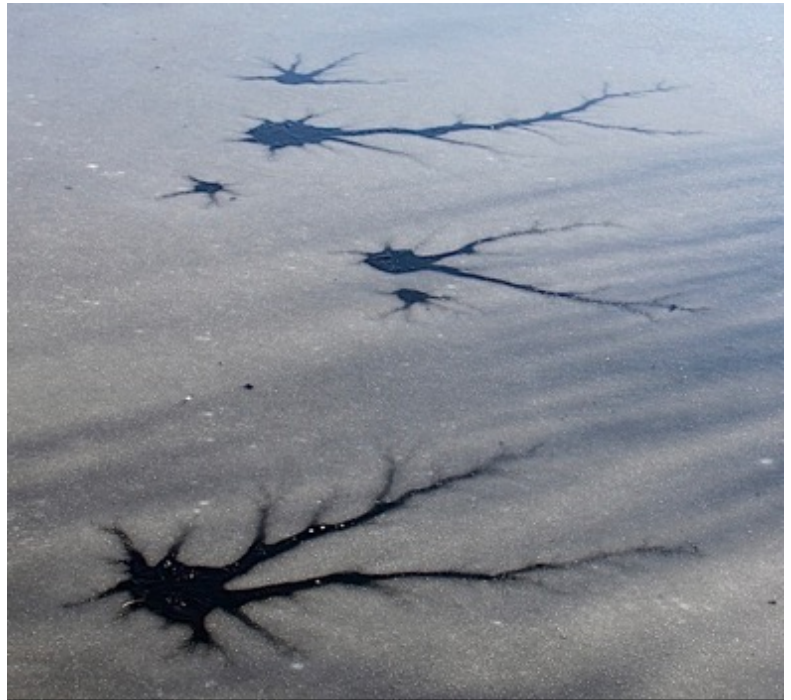
Photo 48. Naturally occurring ice holes.