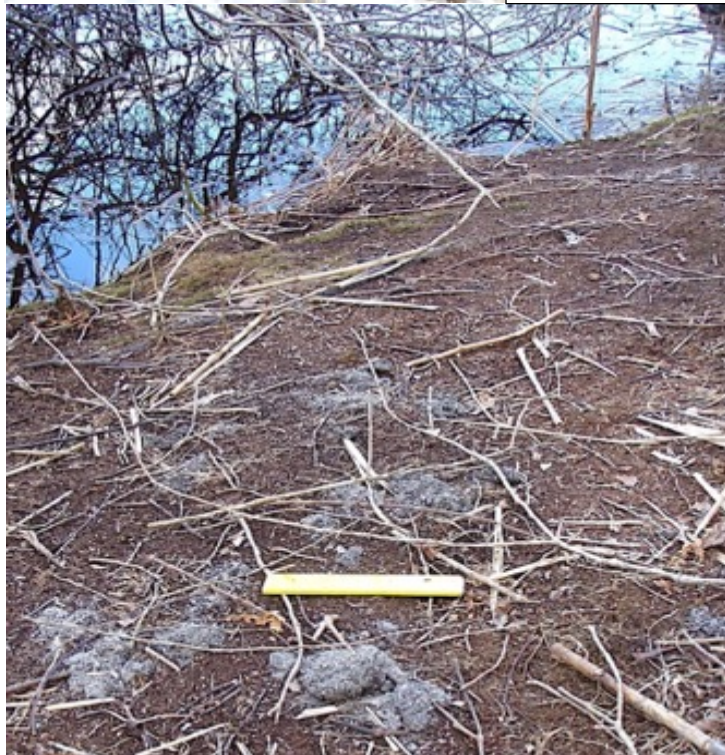
Photo 44. This expansive, disturbed area littered with otter scats was the largest latrine documented on Fishers Island during the 2013 survey.

The snow cave pictured here sat over a small spring hole that enabled the otters to swim out into the pond to fish. It was not clear if the otters used these snow cave microenvironments as energy-saving resting places. This would not be a den site for having young, but it was an interesting find.