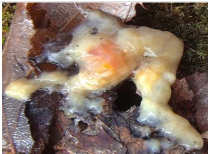
Photo 10. This seldom encountered jelly-like mucous material is an anal gland secretion.