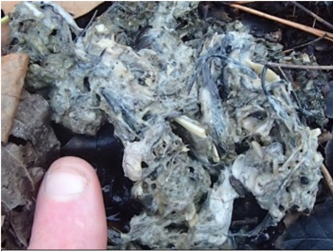
Photo 12. Otter scat with bird remains (feathers and bone) is extremely rare on Long Island.