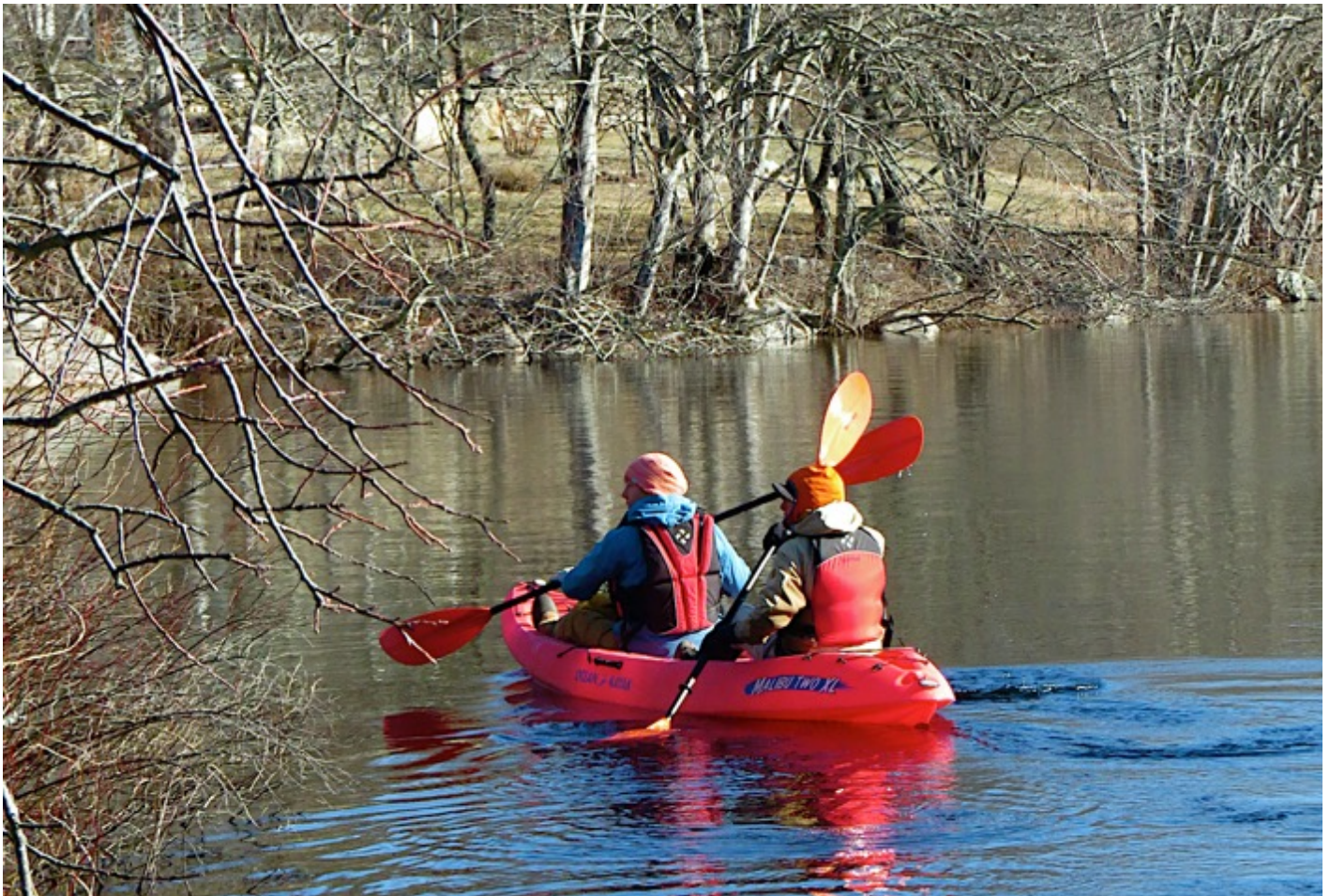
Photo 2. Since otter latrines are usually within 15 feet of the shoreline and quite conspicuous when the leaves are down, surveying by paddle craft is very efficient. This is a useful option where public access to the shoreline is limited.

To distinguish otter latrines that are part of an established home range from that of a transient juvenile dispersing and temporarily marking an area, latrine sites should be visited at least twice during the peak scenting period, with site visits ideally separated by two months or more.