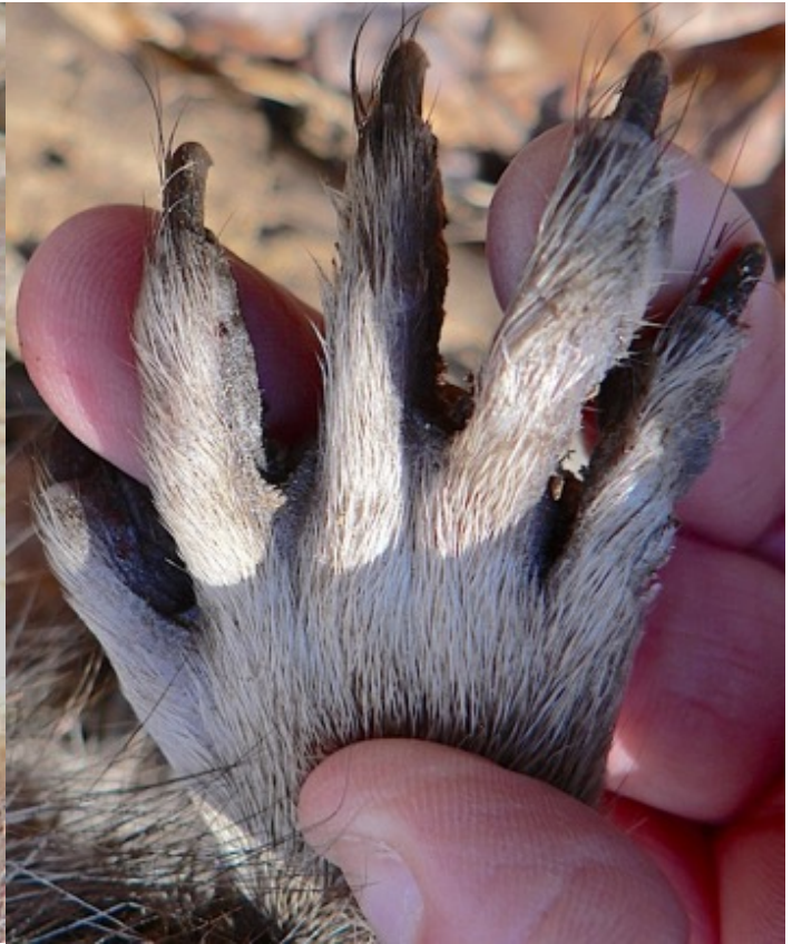
Photos 25 & 26. The long, “fingery,” hand-like and very dexterous toes on the front right foot of the raccoon.