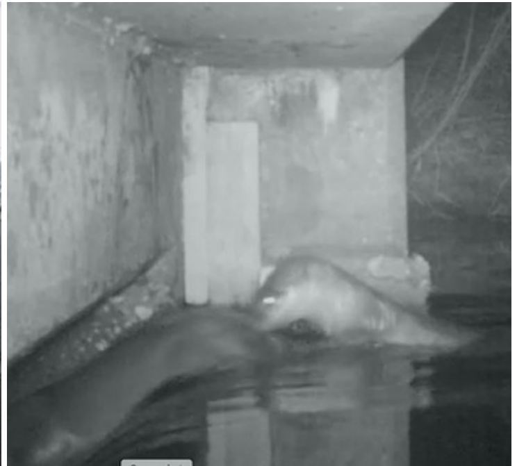
Photo 49. A simple staircase to scale the vertical dam. Photo 50. Verification that otters use it!

Anticipating that otters will be expanding their range along Long Island's south shore, we plan to preempt losing otters to motor vehicle collisions by identifying potential problem dam sites and installing mitigation measures in 2022 and 2023. Some of this work can be dove-tailed with Seatuck's program to provide access to spawning grounds for river herring.