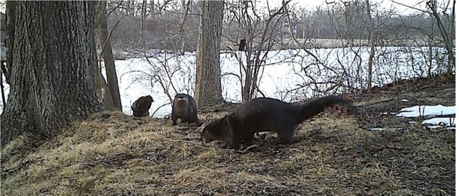
Photo 17. This latrine is situated on a knoll that juts out into a freshwater pond. The photo was taken during the March breeding season; the larger otter in the foreground (most likely the male) is scent marking while the other (female?) watches. Three months later an adult and pup were flushed from the cattails nearby, where they had built “couches.”

4) at pond inlets, outlets and the confluence of tributary streams;