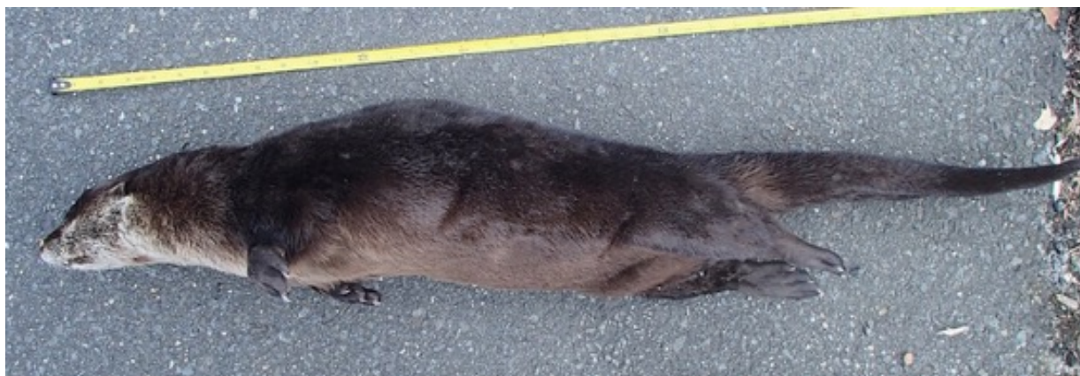
Photo 53. A female otter killed by a motorist near Northwest Harbor in East Hampton on March 2020.

Provide the location of the carcass, your name and your contact information.